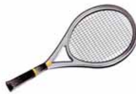
6. a tennis racket