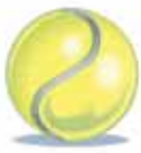
5. a tennis ball