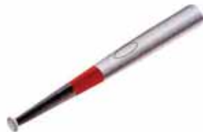
2. a bat