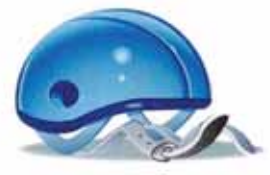
4. a helmet