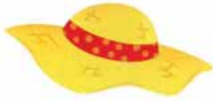
2. a hat