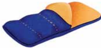
6. a sleeping bag