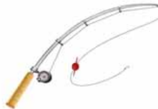
7. a fishing rod