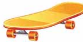
3. a skateboard