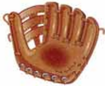
1. a mitt