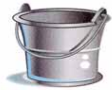
8. a bucket