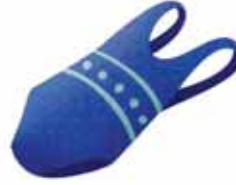
3. a swimsuit