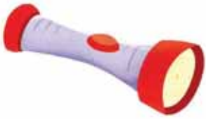
5. a flashlight