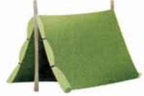
4. a tent